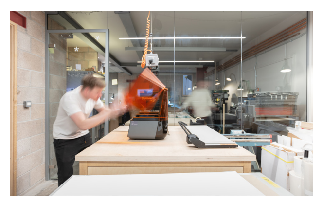
Inside Matter's Design Workshop, with the Formlabs Form 3 3D printer

"We are so impressed with the user experience and the results, that we plan to have a suite of Form 3s running various resins to add capacity and flexibility to our prototyping output. We've recently added a 2nd printer which integrated so easily to an already super busy workshop" Matt Wright, Creative Director