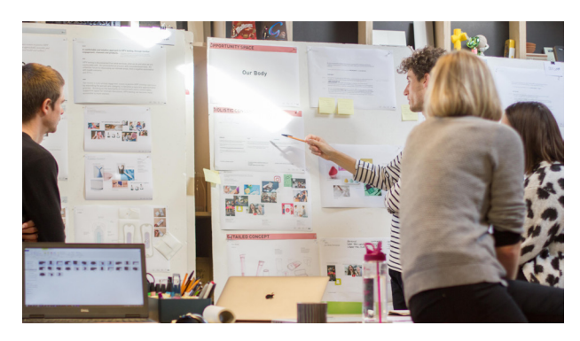
Matter Design Team developing the project brief